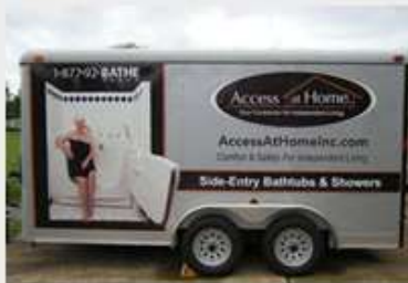
Walkin Tubs Mobile Showroom

Walkin Tubs Mobile Showroom! We can bring our showroom to you!